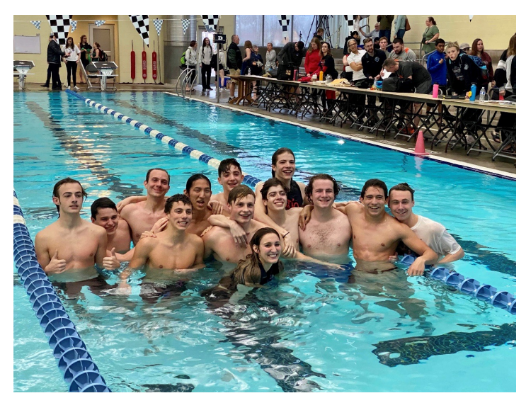
Volunteering as the USA Swimming Stroke and Turn Judge for the high school Districts Championship swim meet for the Oregon School Activities Association (OSAA).