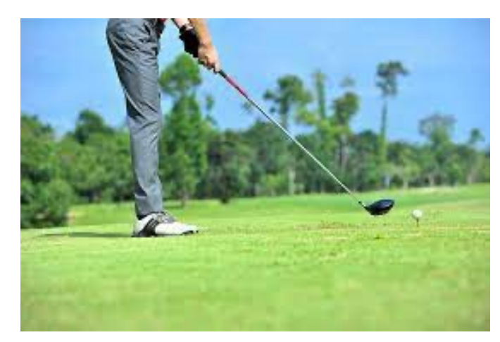
Donating time and money to the St Vincent de Paul church charity golf tournament.