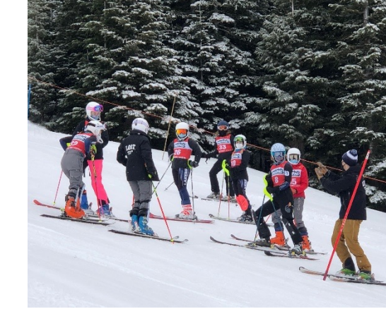
Volunteering for the high school ski races, Oregon Interscholastic Ski Racing Association (OISRA)