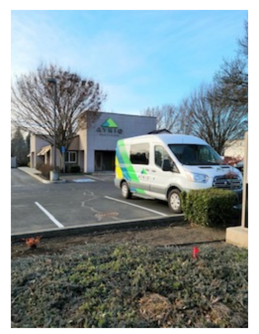
Donating time and money to the Marion Polk food share to help end hunger in Oregon.