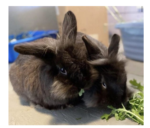
I am so happy to volunteer and foster for the only bunny rescue in Central Oregon, which saves hundreds of unwanted or stray bunnies each year.